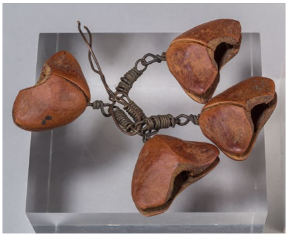
Fig. 5. a) Endocarps of Cascabela thevetia from the collection of Ulisse Aldrovandi. b) the corresponding woodcut in the Dendrologiae naturalis (1667) (BUB).