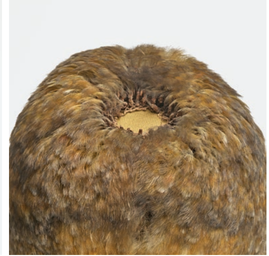
Fig. 9. a) Tupinamba headdress. Courtesy of National Museum of Denmark; photo Roberto Fortuna; b) detail of the feathers' attachment. Courtesy of National Museum of Denmark; photo Roberto Fortuna; c) detail from the painting of the Regina insulae Floridae . Courtesy of Alma Mater Studiorum Università di Bologna – Biblioteca Universitaria di Bologna.

idan context, i.e., in the North American Southeast, which also caused some confusion in later scholarship. Indeed, in her earlier publications Laurencich Minelli argued that the headdress could precisely proceed from "proper" Florida, while in a later publication she opted for a possible Mexican