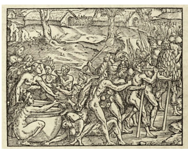
Fig. 4. Woodcuts, from André Thevet, La cosmographie universelle (1575), 922r, 927v. Public Domain.