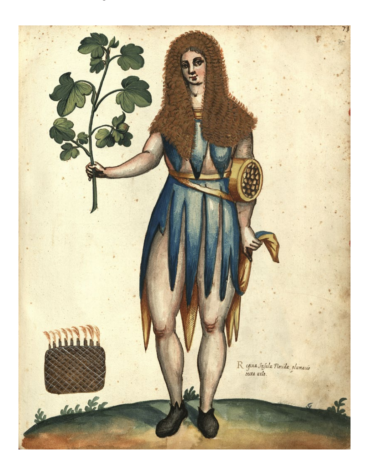
Fig. 6. Regina insulae Florida e (BUB, Aldrovandi, Tavole di Animali , I, 75).