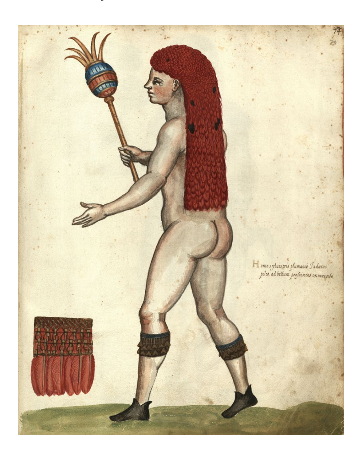
Fig. 1. Homo Sylvestris (BUB, Aldrovandi, Tavole di Animali , I, 74).