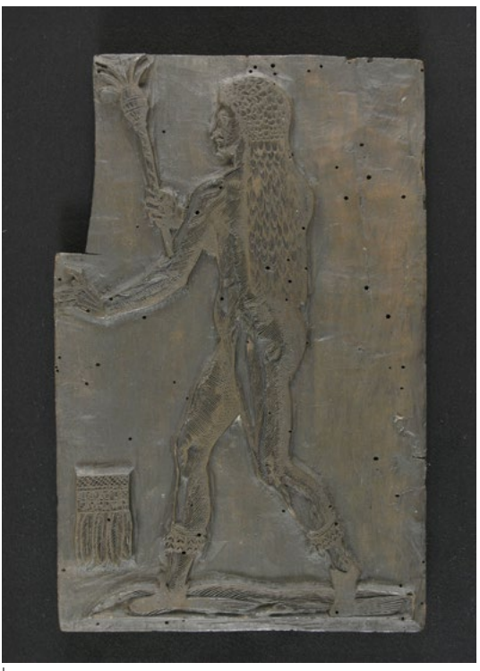
Fig. 2. a) Woodcut of the Homo Sylvestris in the Ornithologia e (BUB); b) matching wooden matrix (Alma Mater Studiorum Università di Bologna – SMA Sistema Museale di Ateneo – Museo di Palazzo Poggi).

crimson feathered cape, calf bands with two rows of hanging rattles made from the endocarps of Cascabela thevetia (also known as Thevetia peruviana ), <sup>11</sup> and closed, moccasin-like shoes. In his right hand he holds a diagonally striped cane topped by a red and blue maraca , with a feather(?) tuff at the top. The headdress, with a few, interspersed dark spots (typical of the plumage of Ibis rubra or Eudocimus ruber ), <sup>12</sup> is clearly divided into an upper and a lower part, distinguished by the different dimensions of the feathers, thus closely corresponding to the textual descriptions mentioned above. At lower left, an enlarged detail meticulously illustrates the way in which the feather quills are attached to the underlying cotton net, as described in detail in BUB, Aldrovandi, ms. 21, IV and ms. 143, IV. The short text inscribed on the painting reads "Wild man from the New World wearing a feathered hat going at war". <sup>13</sup> In the (mirrored) woodcut derived from this painting, the pearwood tablet of which is still pre-