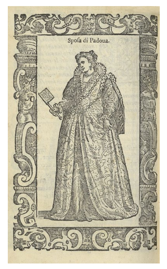
Fig. 11. Paduan bride, from Cesare Vecellio, Habiti antichi et moderni di tutto il mondo (1598), 158. Public Domain.

holosericae, vel bombacinae, vel attalicae, versicolores ("garments of silk, or cotton, or embroidered, iridescent").93 Aldrovandi's use of Vecellio's work to describe Indigenous American products is intriguing because costume books have been studied extensively as works in which - as in the case of Desprez's volume mentioned above - Indigenous garments were made familiar to European audiences through their visual representations.94 Aldrovandi's use of Vecellio somehow "turns the table" by using costume books' visual and lexical descriptions of European garments to convey the sense of the versicolor shimmer of an Indigenous feather mosaic.