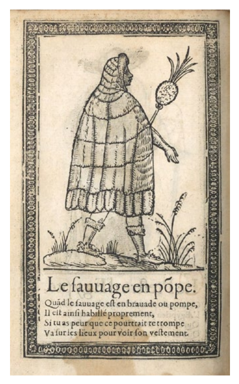
Fig. 3. Sauvage en pompe, from François Desprez, Recueil de la diversité des habits (1562). Public Domain.

poisonous fruits of the ahouaï tree ( Cascabela thevetia ), whose endocarps are used as rattles to be tied to the legs. A dancer holds a maraca and wears calf bands with rattles which are obviously the visual models of those worn by the Homo sylvestris . Moreover, even if the Homo sylvestris feathered cape was copied from the actual artifact in the Giganti collection, the way in which it is worn is derived from another woodcut from Thevet's works, depicting a funeral rite in which a person wears a very similar feathered cape, as well as calf bands with rattles. <sup>18</sup>