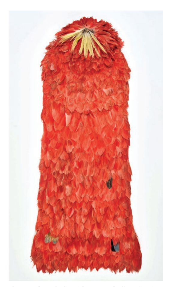
Fig. 8. Tupinamba headdress, now in the collection of the National Museum of Brazil.