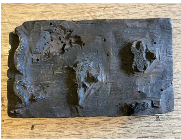
Fig. 10. Feather zoomorphic "idols" from De quadrupedibus digitatis (1637) (BUB), and matching wooden matrix (BUB).